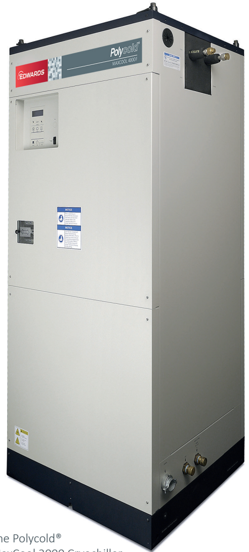
The Polycold® MaxCool 2000 Cryochiller is compliant with European Application Refrigerants (EU No 517/2014) and the US EPA SNAP

MaxCool Cryochillers are the most cost-effective upgrade that you can add to any diffusion-pumped, turbo-pumped, or helium-cryopumped system.